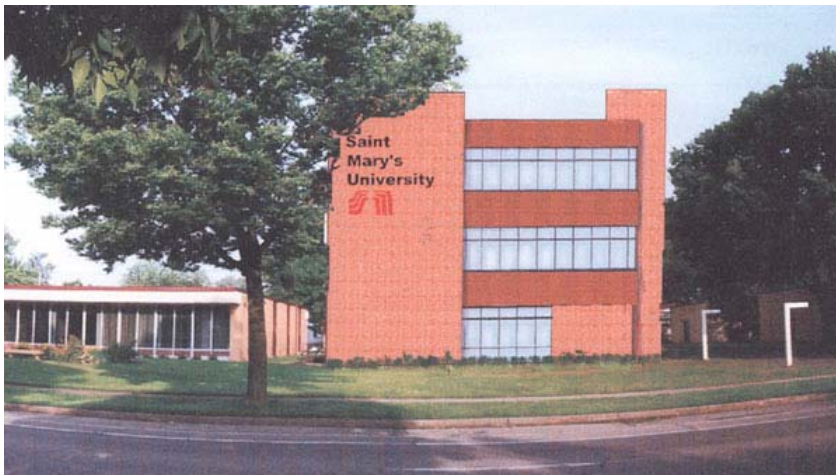
Artists depiction of the new Mother Theresa Hall on Park Avenue

Saint Mary's University of Minnesota is ready to begin construction on an expansion to Mother Theresa Hall on the Twin Cities Campus. The renovation will add two new floors, an elevator and improvements to the plumbing and heating systems. The new addition will add more classrooms and other facilities for student activities.