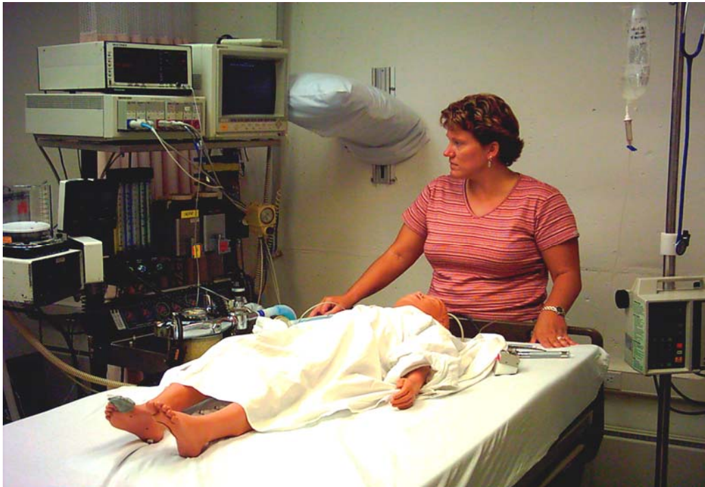
A student contemplates what actions to take with the pediatric simulation scenario.

Junior students will be working with the METI Human Patient Simulator (HPS) again this year. The Health Partners Simulation Center (HPSC) is equipped with a gas machine and all applicable monitors and equipment. Students first work with the adult HPS, applying information from case studies to the scenario. Initially, the HPS will breathe, blink, have a palpable pulse and speak. Once the anesthetic drugs are administered, the HPS will react. Blinking and breathing will stop and the blood pressure will fall. The student is responsible for supporting the airway, intubation, and conducting the anesthetic in a safe and practical way. During the beginning of the Fall semester, students return to the HPSC to challenge the pediatric HPS. The child looks to be about the size of a six year old but can be programmed to be bigger or smaller. Various disease states can be added to either program to simulate more realistic experiences. The Center also has a bronchoscopy simulator to help students prepare to use the fiberoptic bronchoscope for real patient situations.